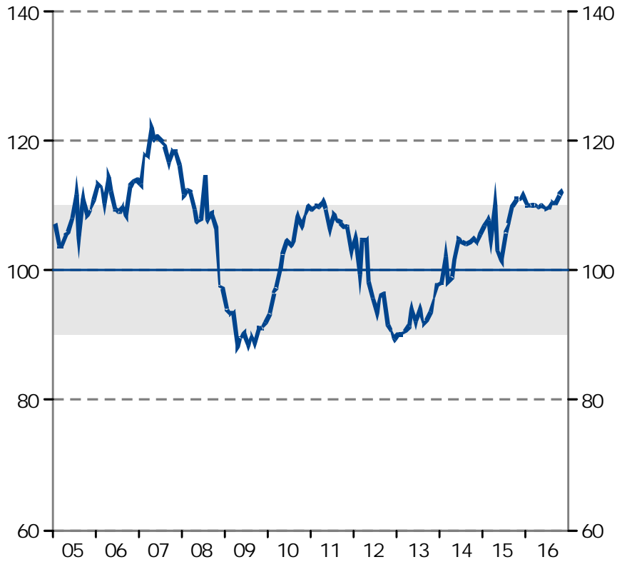
Retail Trade The confidence indicator, seasonally adjusted values. Index, mean = 100