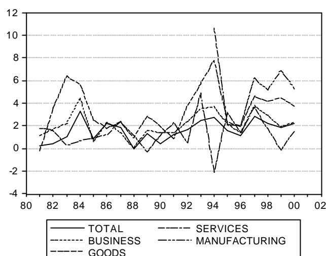
Figure 1. Average labor productivity growth 1981-2000.

creased from 3.2 percent in 1993 to 5.2 percent in 1999 (see table 3 below). In the goods sector this share increased from 4.0 percent to 5.9 percent, while in the service sector it increased from 2.9 to 5.0 percent. Furthermore, the ICT capital share increased from 7.4 in 1993 to 10.1 percent in 1999 in the manufacturing sector, and, interestingly, it decreased somewhat from 32.9 to 31.3 percent in a collective ICT sector consisting of producers of high-tech goods and services. 4