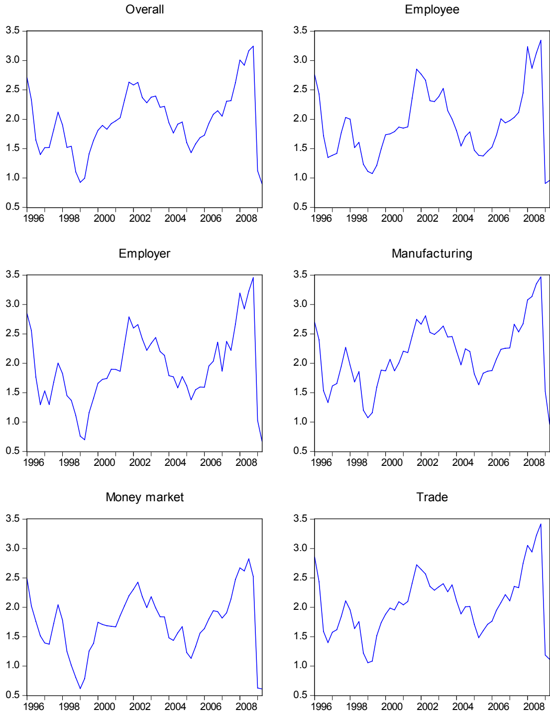
Figure A1. One-year-ahead inflation expectations.